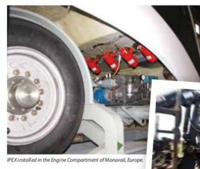
IPEX installed in the Engine Compartment of Monorail, Europe.