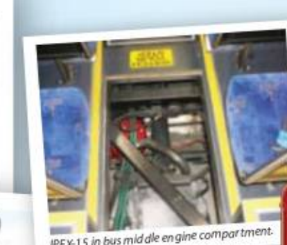
IPEX-15 in bus middle engine compartment.