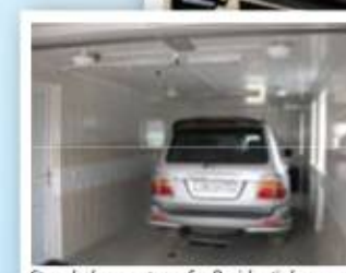
Stand-alone systems for Residential garage.