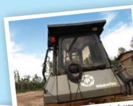
Typical IPEX installations in mining vehicles Europe.