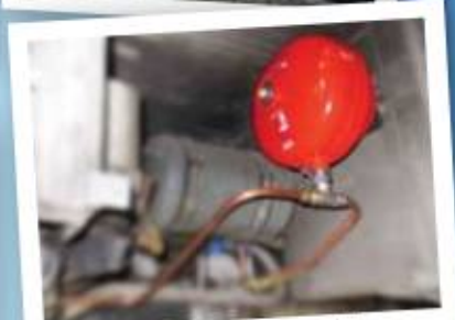
Typical IPEX installations in bus engine compartments, Australia.