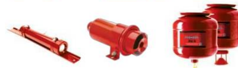
Impulse Powder Extinguishing Modules