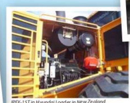
IPEX-15T in Hyundai Loader in New Zealand.